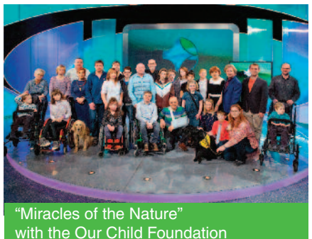
with the Our Child Foundation