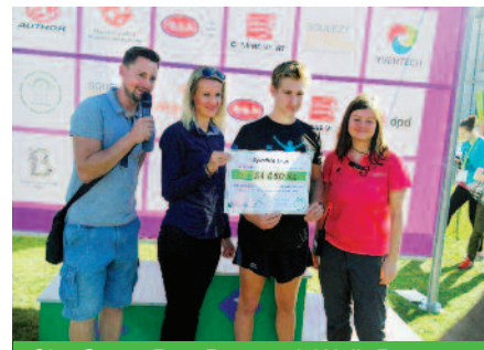
City Cross Run Prague & Walk Prague