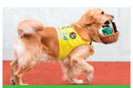
Over a long-term basis the foundation supports four-legged assistants from the organizations Pomocné tlapky (Helping paws) and Helppes (Help dog)