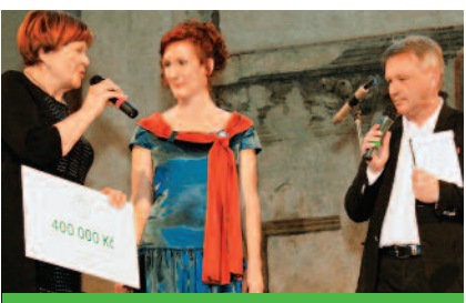
Acorus helps people who have suffered the painful experience of domestic violence. The foundation was glad to help Acorus

Already on several occasions the foundation was able to see the creation of beautiful friendships of handicapped children through the assistance and canistherapy dogs. In 2015, the foundation supported intensive and demanding training of canine helpers and at the same time new members of the families to the amount of 400 000 C7K